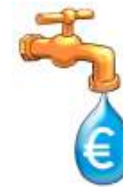
Table for calculation of water waste